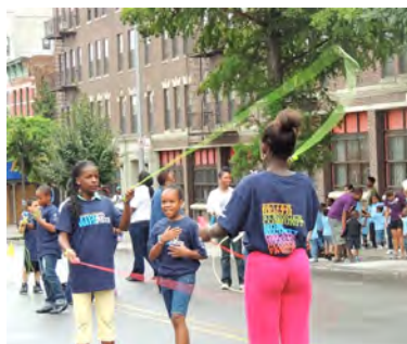
Above: New Settlement Community Campus ribbon cutting with Bronx officials; DREAMS YouthBuild graduates; Semiperm Housing's Celebrate the World event and St. John's Place Family Center's Summer Olympics, with Montefiore's New York Children's Health Project, New York Cares, and Goldman Sachs Teamworks. Left: DREAMS YouthBuild students on the job with Habitat for Humanity and meeting with representatives in Albany.